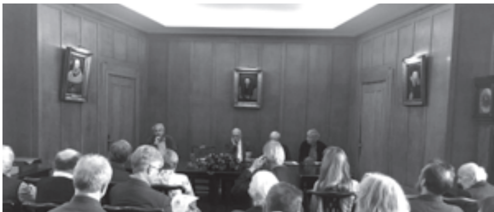
The meeting at Corpus Christi College, Cambridge, 30 March 2019