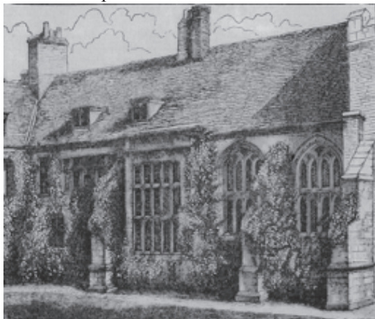
An old drawing of Corpus Old Court