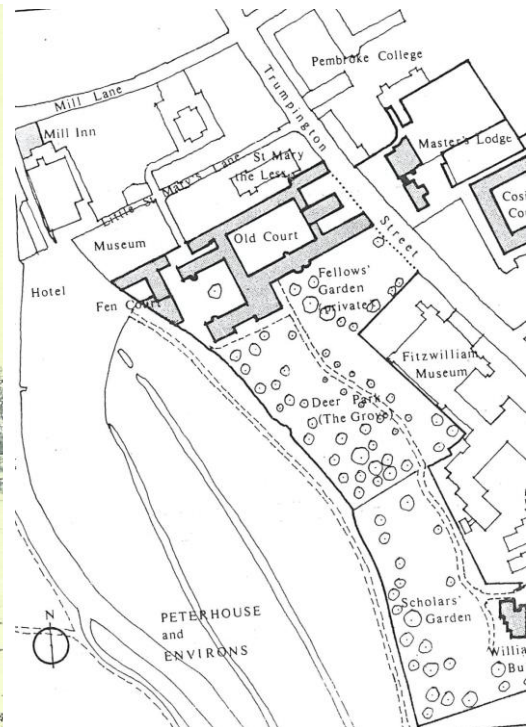
'...the umbrageous purleius...'