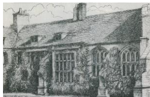
Corpus Christi - the Old Hall & part of the Old Court

"'Corpus!' he cried, leaping to his feet, "do you mean Corpus, Cambridge?...you Corpus people have got a library...that would madden Paracelsus himself. There are folios and volumes there that are...priceless...they've got a number of Bardic Triads there...in an underground chamber... Think of your being at Corpus!"