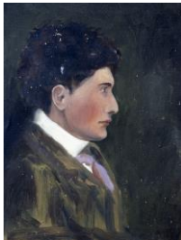
JCP in the 1890s

'Oh how can I express my deep, my indurated, my passionate, my unforgettable, my eternal debt, to that dull, flat, monotonous, tedious, unpicturesque Cambridgeshire landscape?...every rushy brook, every weedy estuary, every turnip field...became part of my soul... Yes! wherever I go I shall carry with me to the end what I learnt from Cambridgeshire while I was at Cambridge.' (Autobiography, JCP)